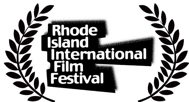
RHODE ISLAND INTERNATIONAL FILM FESTIVAL