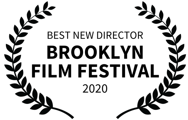
BROOKLYN FILM FESTIVAL