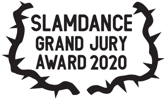
SLAMDANCE FILM FESTIVAL