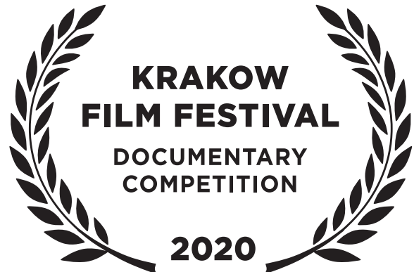
KRAKOW FILM FESTIVAL