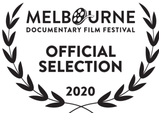
MELBOURNE DOCUMENTARY FILM FESTIVAL